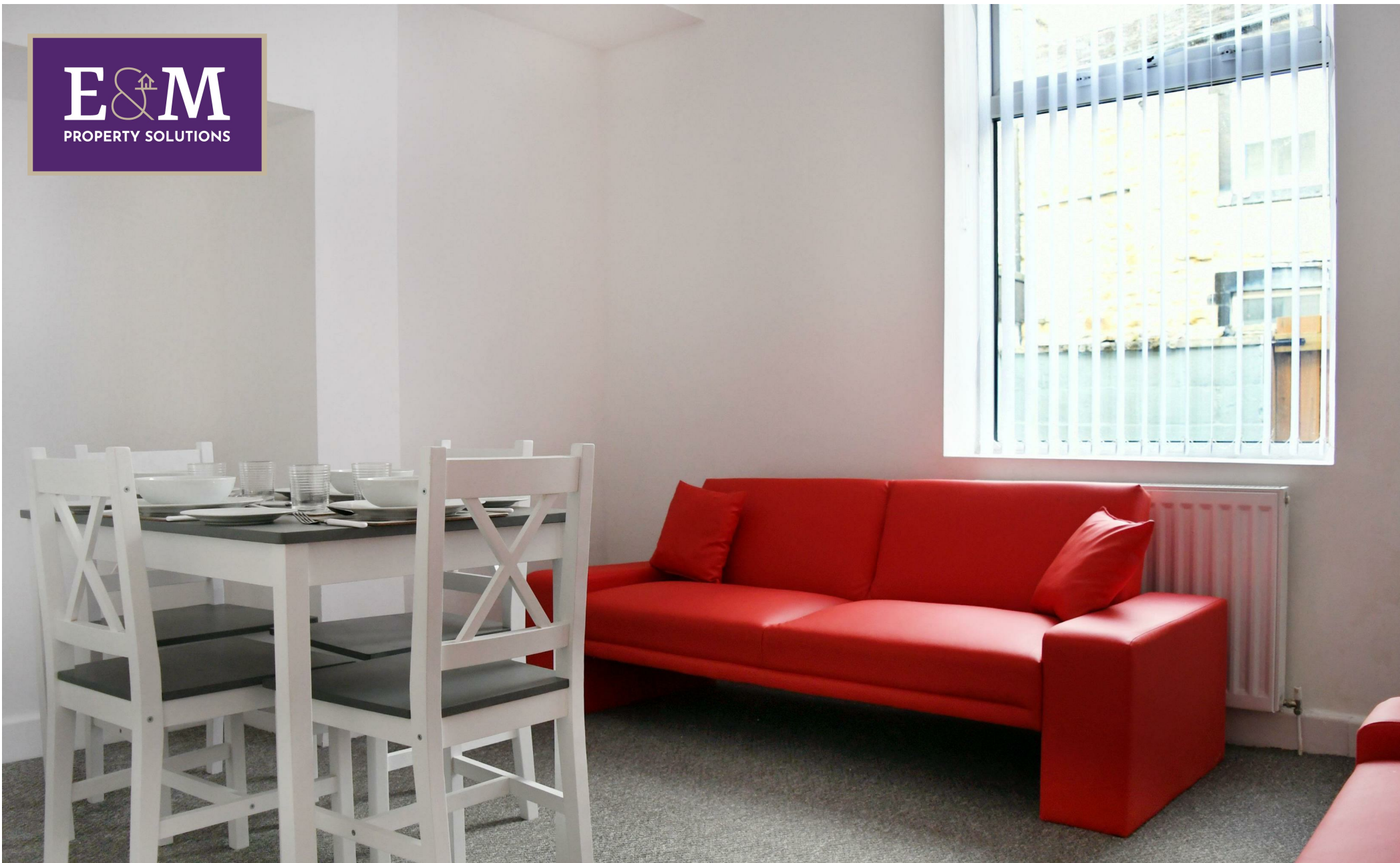
ROOM 3, 7 Woodbine Road, Burnley, Lancashire, BB12 6RE £95 Per week